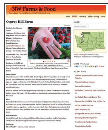
Sample Farm Profile with Slideshow

Slideshow Specifications: Provide 6 digital photos and captions. Photos should be .jpg or .png format. All photos should have a horizontal orientation. Captions must be 15 words or less.